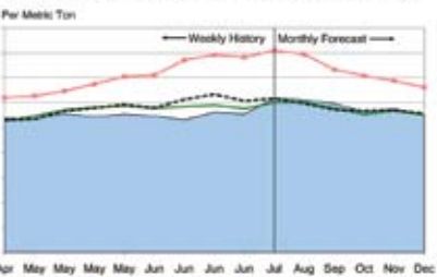
Toluene, Mixed Xylenes & Paraxylene Overview